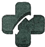
Mobile Crisis Response Team

The team supports youth and families in behavioral and mental health crisis situations and helps to find community services for youth and their families. The Mobile Crisis Response Team (MCRT) is designed to reduce emergency department visits due to a psychiatric crisis and to reduce psychiatric hospitalizations when appropriate by providing immediate support and crisis interventions, short-term stabilization and case management services. Interventions are provided in the community, home, and/or through phone consultation.